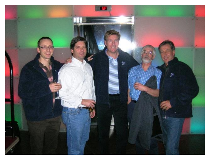
Figure 3. Photo – ISM "Educators" during UK teaching tour.

Robert Bollman of PCA Ground Engineering in Australia made great strides to build confidence in micropiles across their local market.