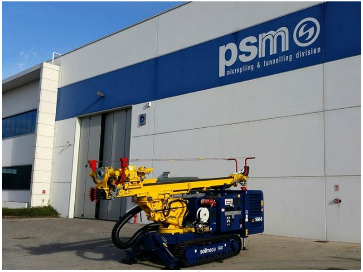
Figure 5. Photo – Modern equipment for limited access applications.

Bruce (2012) provided a summary of drilling methods indicating that double-head or dualrotary tooling was used in the most difficult ground condition. Until recently, this equipment was not readily available within the industry and there are many examples of problems completing projects or damage done to ground conditions when holes could not be completed effectively. Double-head configurations are more readily available to some of the larger contractors and are being used more regularly.