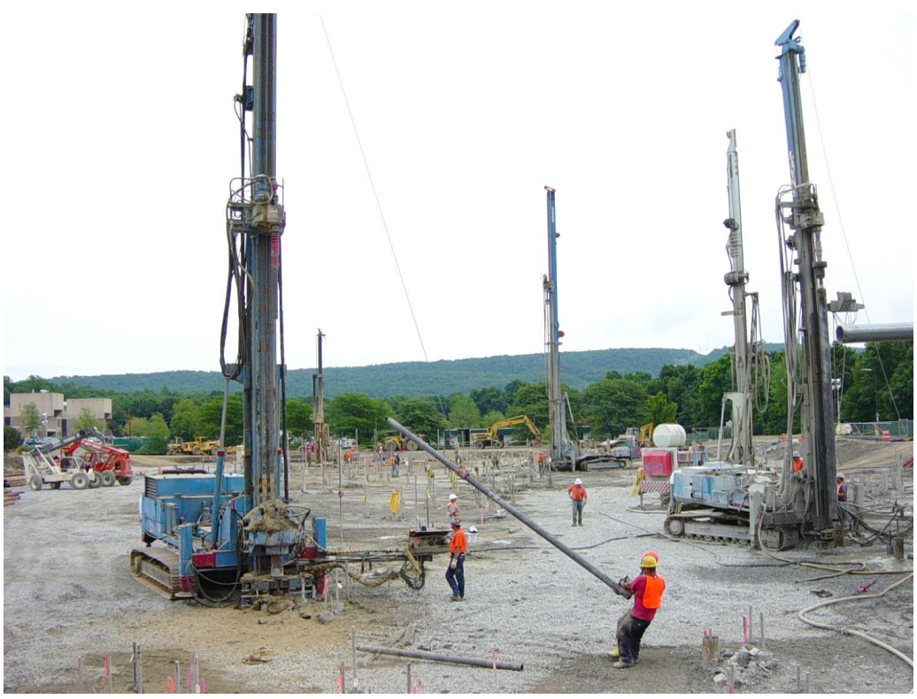
Figure 4. Photo – Large long-mast rigs make greenfield applications cost effective.

China is also currently producing a significant number of rotary drill rigs for the foundation market in Asia. Furthermore, contractors have built their own (or modified) rigs and attachments for micropile installation. Safety criteria for rig operations are beginning to limit the opportunity for contractors to develop rigs when detailed engineering and operation manuals are being required.