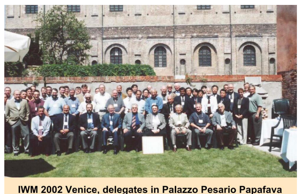
Figure 1. Photo – IWM 2002 Venice, Delegates in Palazzo Pesario Papafava.

I was first invited to the strategic meeting in Lille, France, in 2001 where a formal mission and vision for ISM was established. This led to the celebration in 2002 of the 50<sup>th</sup> anniversary of Dr. Lizzi's contributions hosted by Renato Fiorotto in Venice.