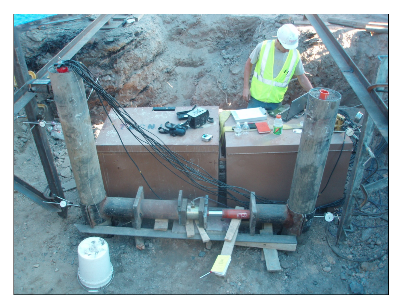
Figure 1 Typical Lateral Load Test Setup

However, more information is required to develop site specific p-y curves. The method discussed herein for developing site specific p-y curves utilizes in-place inclinometers installed within the test micropile.