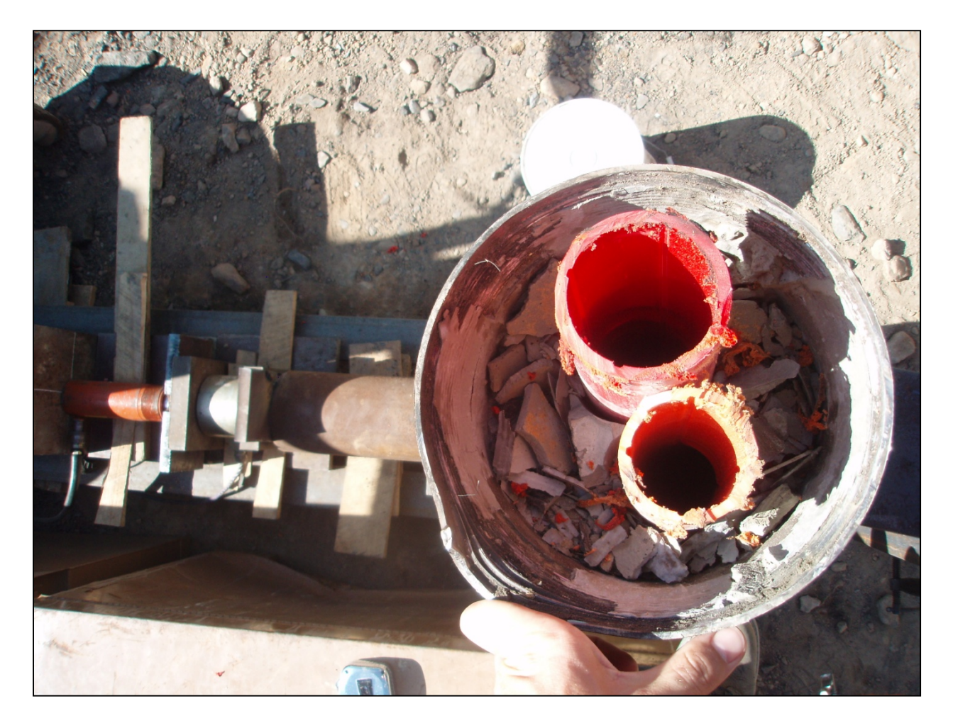
Figure 2 – Inclinometer Casing Orientation

Figure 2 shows the plan view of a typical lateral load test micropile. The figure shows two inclinometer casings placed adjacent to one another perpendicular to loading. Both inclinometer casings should be installed past an expected depth of zero rotation.