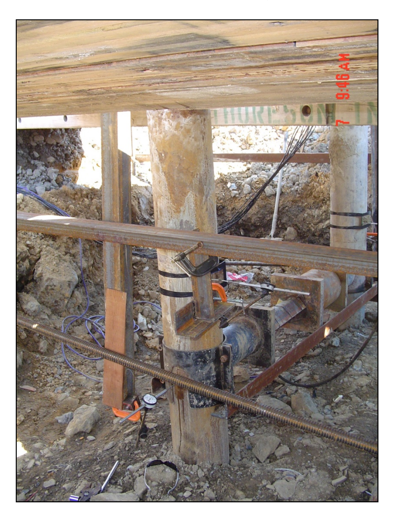
Figure 3 – Lateral Load Setup

In addition to the use of inclinometers which evaluate the micropile deflected shape, measurements should be performed at the pile top during the test. Dial gauges or LVDTs should be used at or very near the opposite side of the micropile loading point elevation and the other a few feet above the loading point. It is important to set the uppermost IPI and end traditional inclinometer readings at the point of loading such that comparing dial gauge readings to inclinometer readings provides additional quality control. Actual stickup and depth measurements of the dial gauge/LVDT and inclinometer pipe need to be documented within 6 mm (0.25 inches) so that deflections relative to point of applied load can be determined. Figure 3 shows a typical set up.